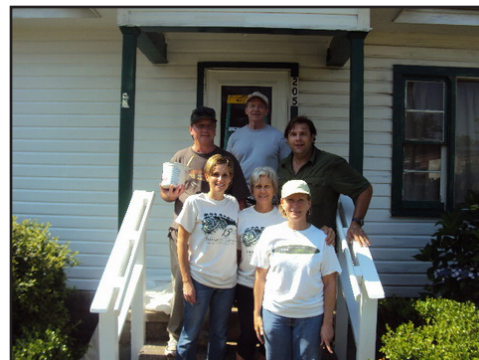
Board of Realtors at 205 Alexander Street