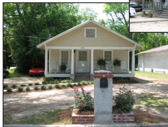
1004 Lester Street (Before and After)