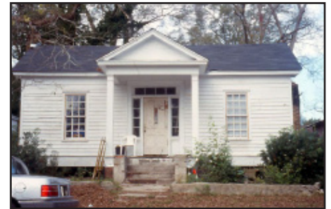
512 N Stevens Street (After)

That first year, 71 volunteers painted and renovated a house at 211 W. Calhoun Street. It was a great experience for the volunteers, who ranged in age from 12 to 84 years old! The Marguerite Neel Williams Charitable Lead Annuity Trust provided a seed grant to help purchase supplies and get the program off the ground. The community's participation leveraged the $2,000 budget for supplies and services into a $10,000 restoration project. Some of the accomplishments included: scraping, sanding, priming and painting the entire house, re-glazing the windows, replacing rotten siding, restoring two Craftsman style porch light fixtures, patching chimneys and valleys on the roof and re-landscaping the yard. Volunteers felt that it was a compassionate and practical way to practice preservation in their community.