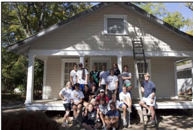
Thomas University's Women's Soccer Team at 1004 Lester Street

The past few years, we have partnered with the Granada Garden Club on landscaping, which has added the icing on the cake. The results of their labors can be seen at 1004 Lester Street, our 2010 project house.