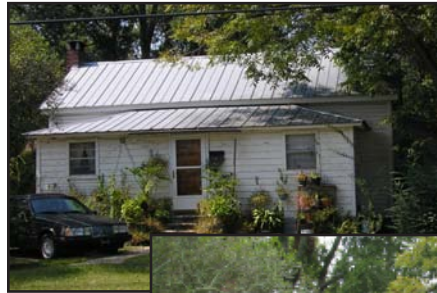
804 Wright Street (Before and After)

In our fourth year, the Board of Directors decided to bend the CPP rules a little that year in light of the ambitious project Landmarks had undertaken in the Warren Avenue neighborhood. Two Warren Avenue houses were painted and re-roofed. Two owner occupied houses were also painted and repairs were made. That year 160 volunteers turned $12,000 in supplies and services into a $40,000 renovation project.