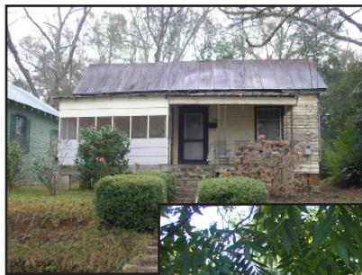
122 E Webster St (Before and After)